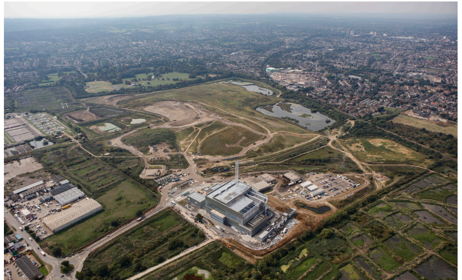
Aerial photograph of the Beddington Farmlands (looking south).

In the coming months, the landscaping around the facility will continue to be established and the construction village (the temporary buildings that were used while the facility was being built) will be removed. This will allow that area to be restored into wet grasslands for the benefit of local wildlife.