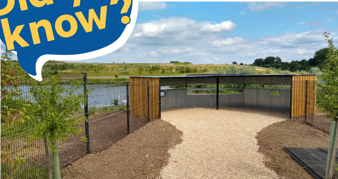
One of the bird hides at Beddington