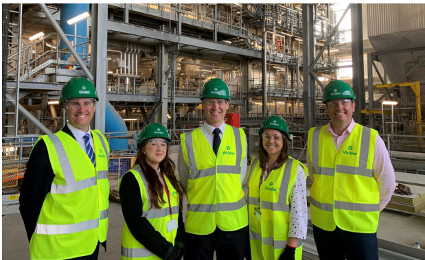
Members of the three charities took a tour to explore inside the Beddington Energy Recovery Facility.

As part of the commitment to develop lasting relationships within communities around its operational sites across the UK, Viridor is committed to supporting the fantastic work of local charitable causes. Nationally Viridor has selected, with the help of its employees, 12 charity partners and three are located near the Beddington site.