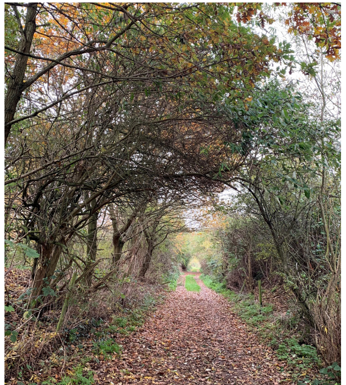
A view along the Beddington permissive footpath

Delegates from each of the charities visited the Beddington Energy Recovery Facility (ERF) in Sutton to receive a cheque for £3,333. St Raphael's Hospice is a local charity that provides exceptional end-of-life care to the people of Merton and Sutton. Based at the Chaucer Centre in Morden, Merton Mencap supports children and adults with a learning disability, and their family carers. The British Home is based in Croydon and offers care for people with severe disabilities and long-term medical conditions.