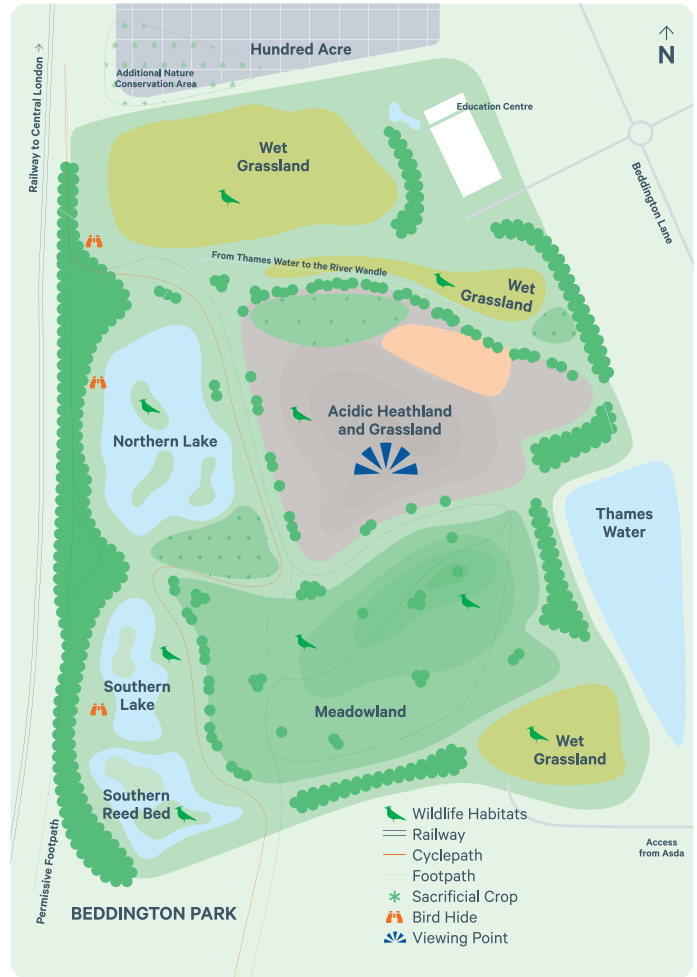
A plan of the restored habitats to be created at the Beddington Farmlands

In the coming months we hope to hold further open days to enable the wider community to explore the Beddington Farmlands. If you would like to register for notifications of these events and updates of the Beddington Farmlands please email beddingtonfarmlands@viridor.co.uk .